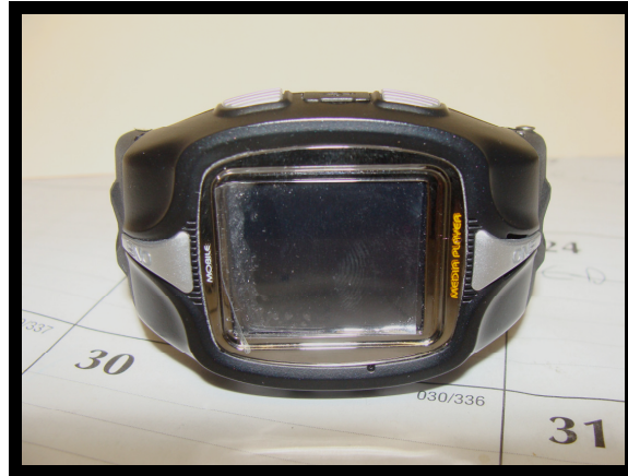
Mobile-Media Player cell phone wristwatch confiscated from inmate.

Once received, the compact size of cell phones allows inmates to easily conceal them from correctional staff in their cells or a common area on the facility grounds. On at least two occasions, correctional staff confiscated cell phones that resembled wristwatches from inmates. Inmates often hide cell phones in fans, light fixtures, books, mattresses, the walls of their cells, sinks, toilets, or shelving units.