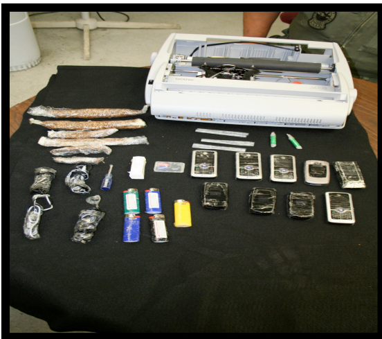
Contraband found in a typewriter: cellular phones, weapons, lighters, and tobacco.

Inmates' friends and family members have developed a variety of methods to smuggle cell phones into prisons. One of the newest techniques is to circumvent security measures by intercepting quarterly packages 1 from state approved vendors, stuffing them with cell phones, resealing the box, and forwarding it to the inmate. These phones are concealed inside of DVD players, televisions, radios, typewriters, books, toilet paper, cereal products, and various other items. If the received package is from an approved quarterly vendor and appears intact, Department staff will deliver it to the inmate.