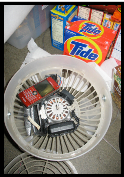
Cell phone and adaptor connected to electric desk fan motor to charge battery.