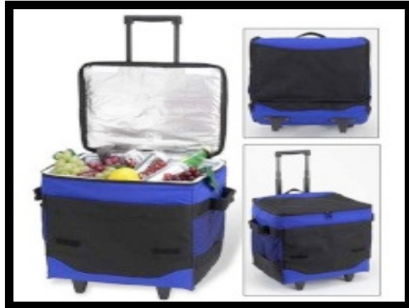
Over-sized rolling lunch container used by staff. (Not to scale.)

Staff and contracted employees bring cell phones into prison utilizing several methods including hiding the small devices on their persons and in over-sized rolling lunch containers, briefcases, file boxes, and backpacks. Some institutions are now using container measuring devices, also known as lunch box assessors, to limit the size of personal items entering the prisons. If these items do not fit into the assessor, they are not allowed into the prison. Concealment on their person has proven the most effective method because staff are rarely searched due to the cost and logistics of searching hundreds of employees. In one incident, a female contractor placed seven cell phones in her bra in an attempt to smuggle them into an institution.