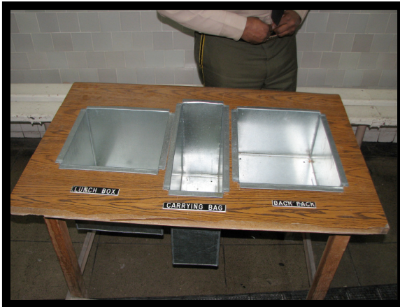
LUNCH BOX ASSESSOR – Left to right Lunch Box (12" wide x 12" long x 12" deep); Carrying Bag (6" wide x 18.25" long x 14" deep); Backpack (12" wide x 15.25" long x 8" deep.)

It is becoming common for inmates to hide cell phones and chargers at their work sites so if discovered, they cannot be readily traced to them. Recently, a prison's Investigative Services Unit conducted a search of its Prison Industry Authority facility and discovered a large tactical bag containing 22.7 pounds of tobacco, 1.8 pounds of marijuana, 35 cell phones, and one glass smoking pipe.