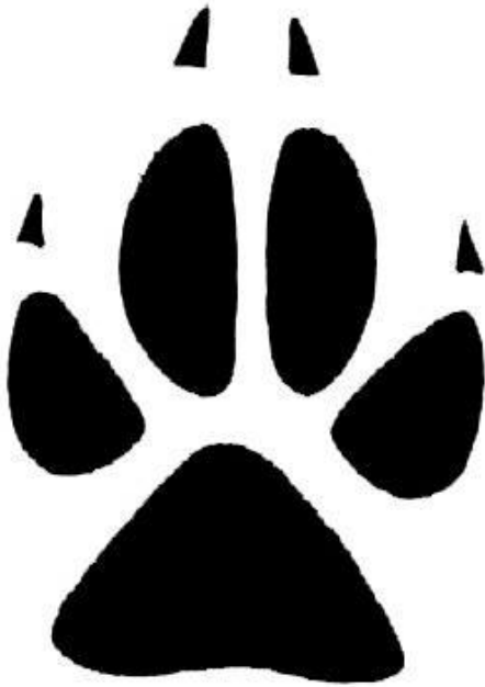
Front foot track