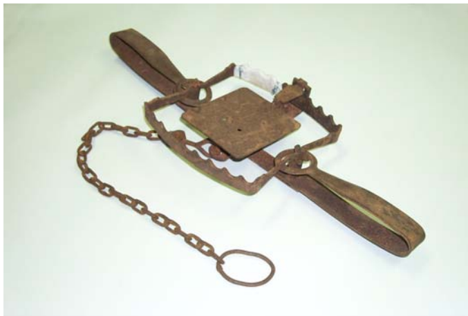
A properly adjusted Lanes trap ready to be attached to an anchor point or drag, and set in the ground.

Hint: Care must be taken to ensure the wire is not ripped away before the dog chews on the soft wrapping, otherwise the wrapping may be torn away easily, and the dog may not ingest any poison. As a precaution against Strychnine loss through the cloth, some doggers choose to bind the finished Strychnine pad with electrical insulation tape.