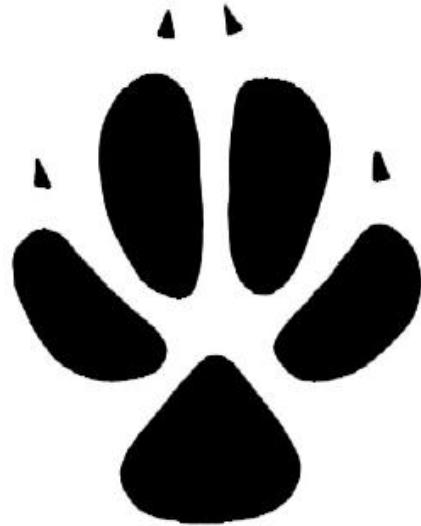
Hind foot track