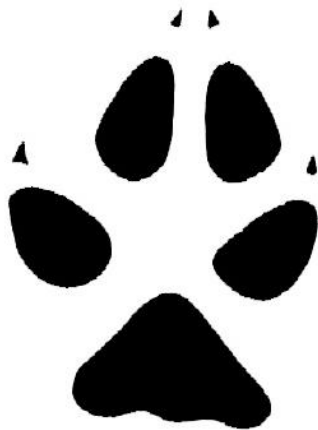
Front foot track