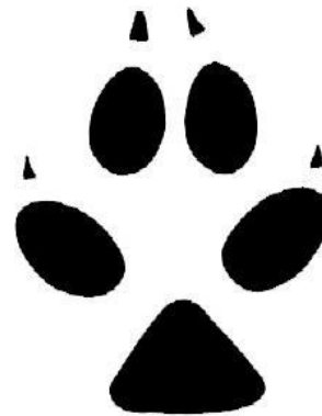
Hind foot track

The size of prints can vary widely, depending on the sex, age and weight of the animal, the hardness of the ground and the speed at which the animal is travelling. For an individual dog, the prints of the fore-feet are always larger than the prints of the hind-feet. The prints of an average sized fox are smaller than those of an average sized dog. Fox prints are also generally more elongated and proportionally narrower than those of dogs. Note the gap between the pads of the two middle toes and the heel of the fox prints. For further information please refer to the Wild Dog Management Best Practice Manual.