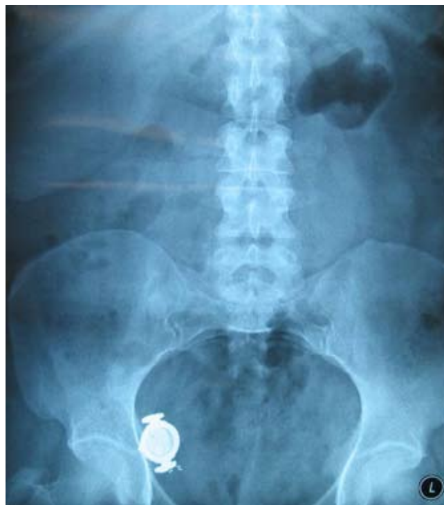
Fig 3. Wrist-watch in right iliac fossa. Failure to progress beyond terminal ileum.

There is no published epidemiological data describing the true prevalence of foreign body ingestion in the prison population. From review of published case series, patients affected range from 22 to 167 cases in the United States series to 261 cases from larger European studies 3, 7-8 .