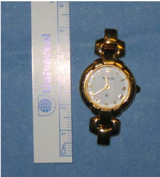
Fig 4. Endoscopic retrieval of wrist-watch was successful. The watch was still functioning.

retrieval net was superior to the basket or forceps technique 11 . If the blunt object has passed in to the stomach and is less than 2cm in diameter, a conservative outpatient management protocol with weekly radiographs should be adopted. If the blunt object remains in the stomach, it has been recommended to delay endoscopic retrieval for 1-2 months to facilitate any opportunity for spontaneous passage 2,5,11,12 . Blaho et al also recommend a 3–4 week waiting period to allow passage before attempts at endoscopic retrieval are made 5 . Zuloaga et al suggest a two month waiting period 12 . One of the patients in our study presented with a five week history of colicky right iliac fossa pain. The abdominal X-ray on presentation revealed a wrist-watch in the right iliac fossa suggestive of probable impaction at the terminal ileum (Fig 3). Repeat X-rays showed