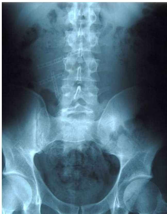
Fig 1. Razor blades in the small bowel.

Deliberate ingestion of foreign bodies is common amongst prison inmates. The motives behind the ingestion are variable. As the only designated hospital in Northern Ireland treating acute surgical pathologies in the prison population, we reviewed our experience of foreign body ingestion between March 1998 and June 2007. Types of foreign objects, symptomatology, haematological analyses, radiological findings, operative intervention and complications were retrieved from case notes. A literature search was performed using Medline to correlate this clinical data with published evidence to produce therapeutic guidelines to assist the surgical multi-disciplinary team.