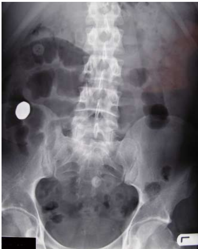
Fig 2. 20-pence coin in the right iliac fossa. Dilated loops of small bowel proximal to coin. Reproduced with permission from the Irish Journal of Medical Science - Reference 4

colon were resected with a primary anastomosis performed. Histopathological analysis revealed Crohn's Disease with stricturing distal to the impacted 20-pence coin 4 . Patient 11 was admitted after intentionally swallowing a wrist-watch 6-weeks prior to presentation. Endoscopic retrieval from the ileo-caecal junction was successful (Figs 3, 4). Two further patients (9 & 10) required operative intervention for continuing obstructive symptomatology. An enterotomy was performed with extraction of the metallic foreign body followed by primary closure in both instances.