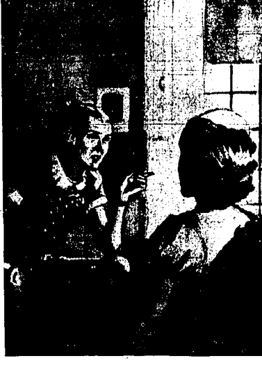
Illustration by Ed Gunder